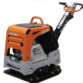
Plate size WxL in (mm) - 19.7x28.3 (500x720) Centrifugal Force lbs. (kN) - 8,318 (37) Exciter Speed VPM - 5,200 Operating Weight lbs. (kg) - 463 (210) Max travel Speed ft/min (m/min) - 85 (26) Cyclonic Pre-Cleaner - Single