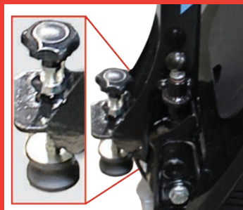
Adjustable handle height - reduce operator fatigue and improves comfort .