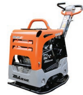
Plate size WxL in (mm) - 16.9x27.6 (430x700) Centrifugal Force lbs. (kN) - 6,070 (27) Exciter Speed VPM - 5,400 Operating Weight lbs. (kg) - 331 (150)