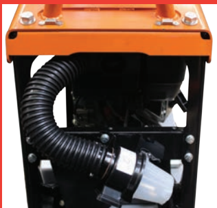
Cyclonic pre-cleaner - significantly reduces maintenance frequency and prolongs maximum efficiency of engine.