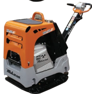
Plate size WxL in (mm) - 24x34 (600x860) Centrifugal Force lbs. (kN) - 10,116 (45) Exciter Speed VPM - 4,400 Operating Weight lbs. (kg) - 794 (360) Max travel Speed ft/min (m/min) - 79 (24) Cyclonic Pre-Cleaner - Single