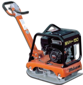
Plate size WxL in (mm) - 15.8x23 (400x580) Centrifugal Force lbs. (kN) - 5,058 (22.5) Exciter Speed VPM - 6,000 Operating Weight lbs. (kg) - 256 (116)